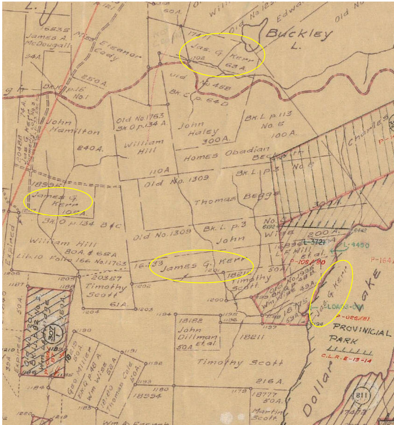
Map 74, Nova Scotia Crown Land Information Centre.